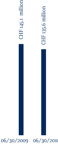
Total operating income